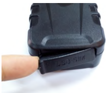
Lift the rubber cover