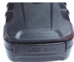
Close the cover

The LEDs light solid whilst searching for both mobile and GPS signals. After 30 seconds the LEDs should start to flash. The tracker must be outdoors or very close to a window to receive GPS signals. Observe the LED's. After a short while, the LED's will turn off to preserve battery life.