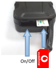
Insert the SIM card & turn on